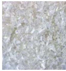
PET Bottle Flake