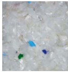
HDPE Milk Jugs