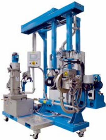
LPU™ with operator panel and SLC pelletizer

The top-mounted Model 5 underwater pelletizer is available with blade advance design based on customer requirements, and includes a self-aligning cutter hub assembly. The blade advance will be spring-loaded (SLC), manually adjustable (MAP) or electronically adjustable (EAC).