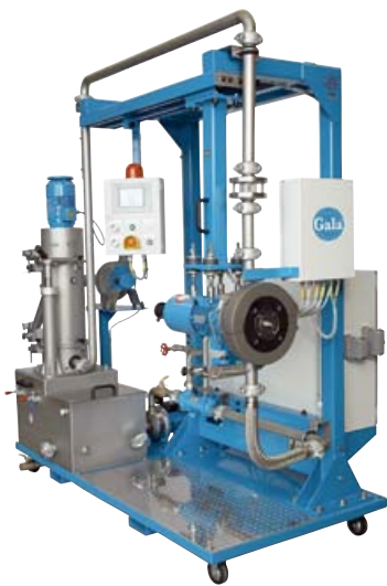
LPU™ melt connection to die plate

All necessary electrical controls, based on state-of-the-art touch screen technology, are contained in a modular panel standing on the frame of the system.