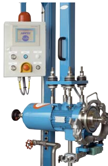
Operator panel with touch screen and Model MAP-5 Pelletizer