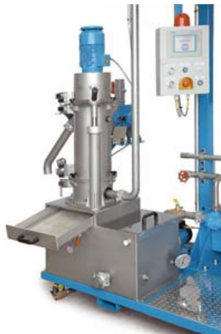
Fines removal built into water tank