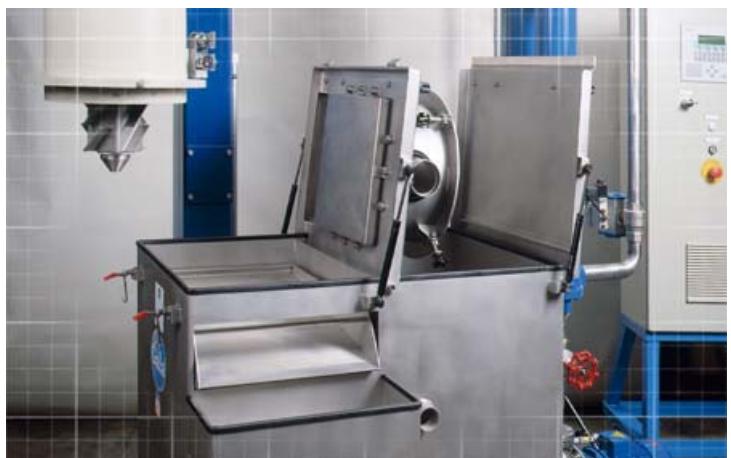
Fines Removal Screen Access

The dryer base section is bolted to one of the two tank lids for quick, easy cleaning and service by simply raising the lid.