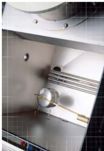
The process water tank

The dryer features a one-piece screen for easy cleaning. A high-efficiency fan is built into the dryer to provide a strong, adjustable counter-current air flow for efficient pellet drying.