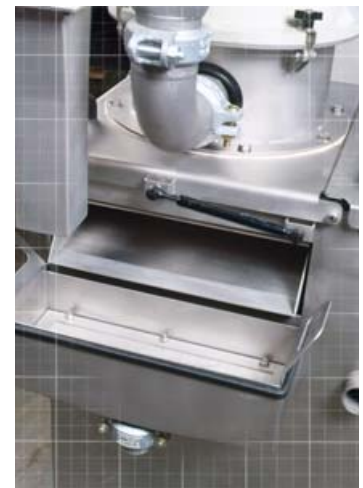
Fines Removal Tray

The process water tank is easier and faster to clean because of the sloping V-shaped bottom and easy access.