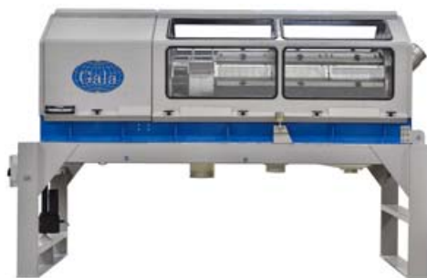
Gala Tumbler Model T/C—203